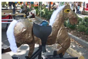
Auctiva's Winged Horse (Judge's Award 2008 Below); Chico Project's 2008 entry (right) that featured $500 as its mane; Landacorp exotic beauty (left); KZFR (above left)