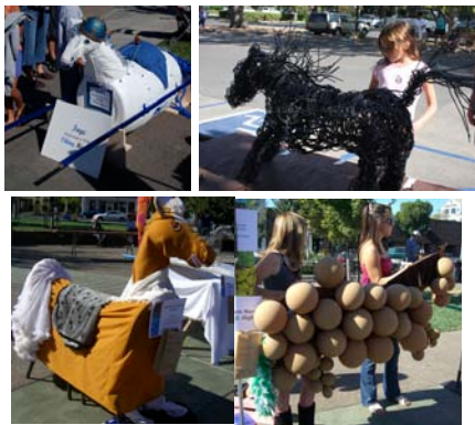
Pleasant Valley High School (top row left); Fair View High School, (top row right); 6th Street Drop-in Center (bottom left); Hank Marsh Junior High School (bottom right)