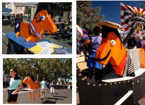
Sisterhood of Creativity makes a public favorite: Pokey Around the World . You never know where Pokey will be visiting but we're glad he shows up to Chico Palio!